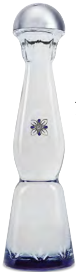
CLASE AZUL PLATA CLASE AZUL 700ml / 40%

Clase Azul Tequila Plata is the unaged tequila that captures the rich and complex flavor of the agave plant. This pristine spirit is the base for all Clase Azul tequilas. The attention to detail at every stage of creating this tequila is highlighted in the range of aromas and flavors, showcasing the master distiller's craftsmanship.