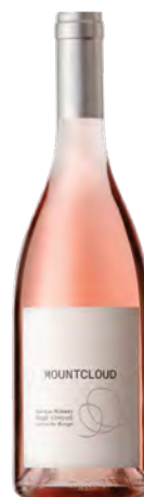
MOUNTCLOUD ROSÉ NAVITAS WINERY 100% Grenache Rouge BIO/VEGAN Rosé | Still | Dry P.G.I. Pieria Northern Greece

Fruity bouquet with red fruit aromas - mainly strawberry and cherry. Botanical hints of eucalyptus and spicy notes of white pepper. Elegant mouthfeel with crisp acidity and aromatic finish.