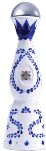
CLASE AZUL REPOSADO CLASE AZUL 700ml / 40%

Clase Azul Tequila Plata is the unaged tequila that captures the rich and complex flavor of the agave plant. This pristine spirit is the base for all Clase Azul tequilas. The attention to detail at every stage of creating this tequila is highlighted in the range of aromas and flavors, showcasing the master distiller's craftsmanship.