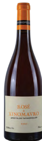
ROSÉ DE XINOMAVRO THYMIPOULOS VINEYARDS 100% Xinomavro Rosé | Still | Dry P.G.I. Macedonia Northern Greece

A multi-layered bouquet with sweet hints of pomegranate and cherry and aromas of wild strawberries, while as it opens up in the glass, hints of caramel and vanilla emerge, an example of the wine's maturation for 8 months in oak barrels. In the mouth it is round, with a velvety feel as a result of the time spent in the barrel with the fine lees. The balanced acidity gives it a sense of liveliness and the few tannins add complexity. Unfiltered.